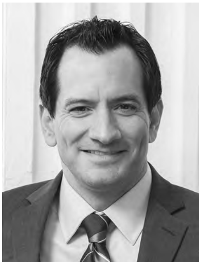
ANTHONY RENDON SPEAKER OF THE ASSEMBLY