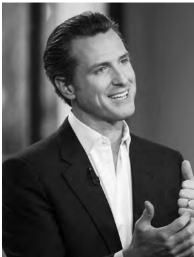
GAVIN NEWSOM GOVERNOR OF CALIFORNIA