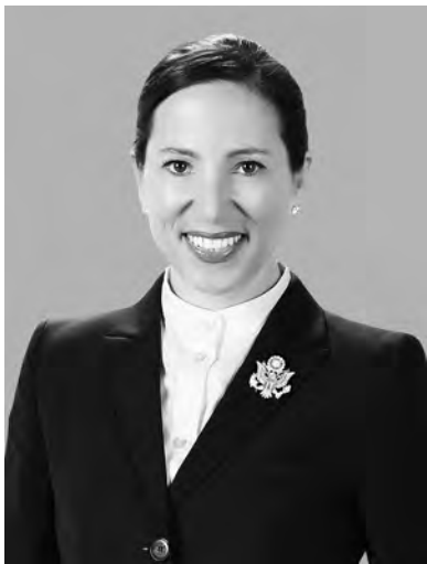
ELENI KOUNALAKIS LIEUTENANT GOVERNOR