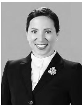
ELENI KOUNALAKIS LIEUTENANT GOVERNOR