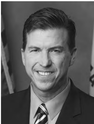
KEVIN MULLIN SPEAKER PRO TEMPORE OF THE ASSEMBLY