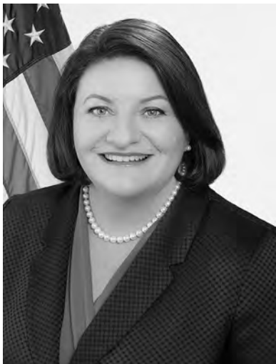
TONI G. ATKINS PRESIDENT PRO TEMPORE OF THE SENATE